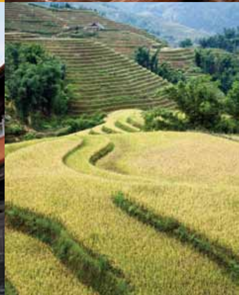
Vietnam is home to architectural wonders such as the Perfume Pagoda, built into Huong Tich Mountain (centre left) and Phat Diem cathedral (bottom centre), while its famous cuisine delights food lovers. In contrast to the tranquility of rural areas, the city of Hanoi (bottom left) buzzes with activity and commerce